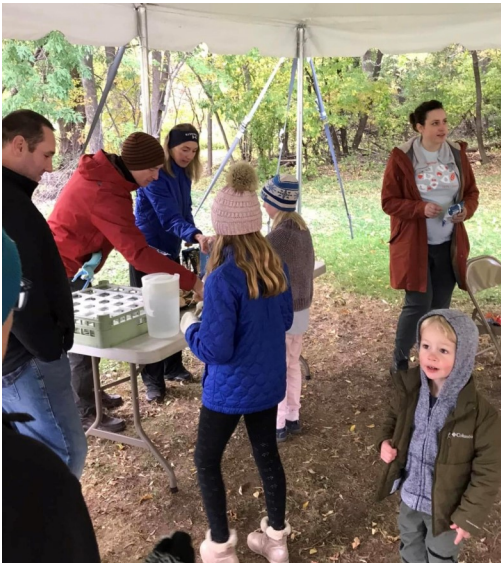
October Peace and Praise Worship under the tent.

Note: Middle and High School Youth are invited to participate in an Intergenerational Blanket Exercise on Nov. 9. This is part of a series entitled "Settlers on Indigenous Land" (see p. 1 for more details).