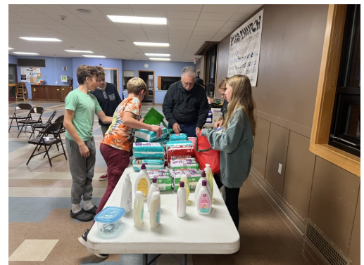
Youth Group helping pack bags of supplies for the Bethany Crisis Center