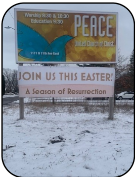
Easter persists in a snowy Holy Week.