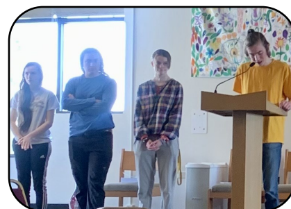
High School leaders prepare the Easter Sunday story.