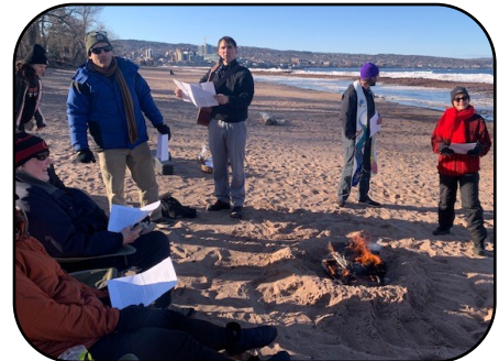
Easter Vigil on the beach