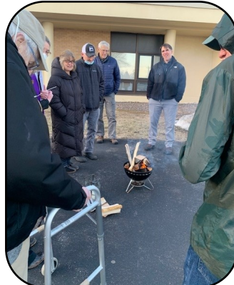
Easter Vigil at Church