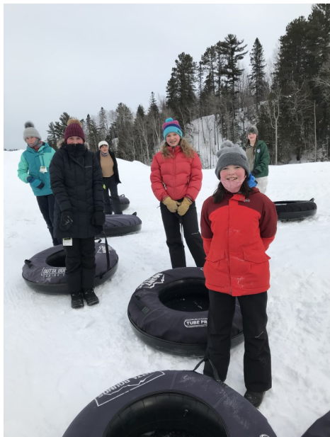
Tubing at Mont du Lac

Come join us for Children's Church each Sunday during the 10:30 service! We've consistently had a group of about 10-15 kids, youth, and adults and it's a ton of fun. If you haven't heard about it yet, the basic idea is that kids stay for the service until story for all ages, leave for Children's Church for 20-30 min (where we might sing, do art, or tell stories with puppets), and then come back with the adults for communion/offering. All kids and youth (and parents!) are welcome to join.