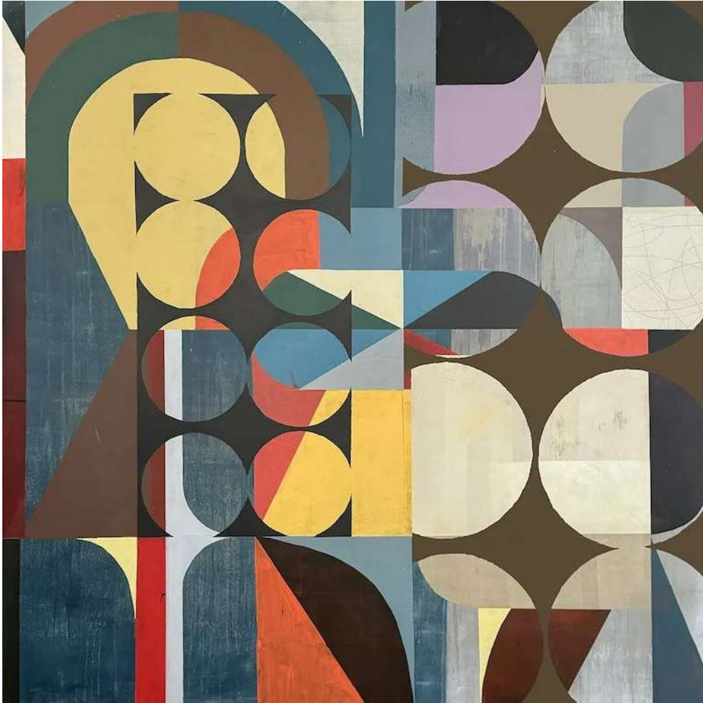
Pivot, Gordon Studer

1111 North 11th Avenue East, Duluth, MN 55805