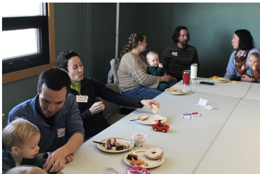
Parents of Nursery Age Children ate breakfast together Sunday, March 26

We offer nursery for our children at Peace Church. Based on feedback from parents, we will have staff in our nursery rooms (past our church office and back through the children's library). Staff will be available there during the 10:30 service. Parents, please make sure to fill out the sign in/out sheet with your information before you drop off/pick up your kids. Please let us know if there are needs we are missing or any questions/concerns that you have as parents. Thanks!