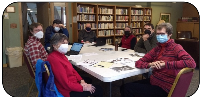
Thanks to our Worship and Arts Team for all their work and dedication to worship planning.