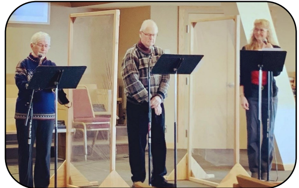
Our wonderful volunteer choir on Sunday, January 23 for our livestream only service.