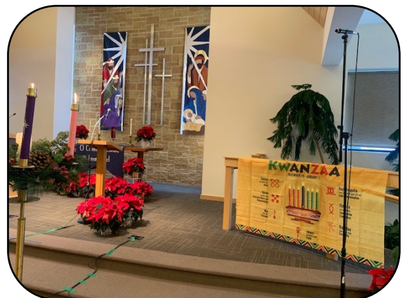
Worship staff recognized Kwanza in service on Sunday, December 26.