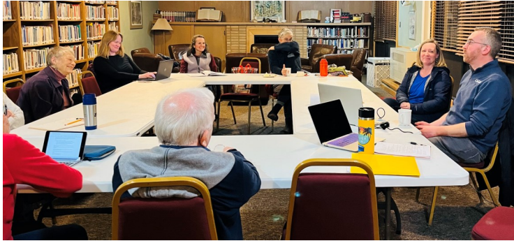
Coordinating Council learning about Stepping On Up and Lutheran Social Services.