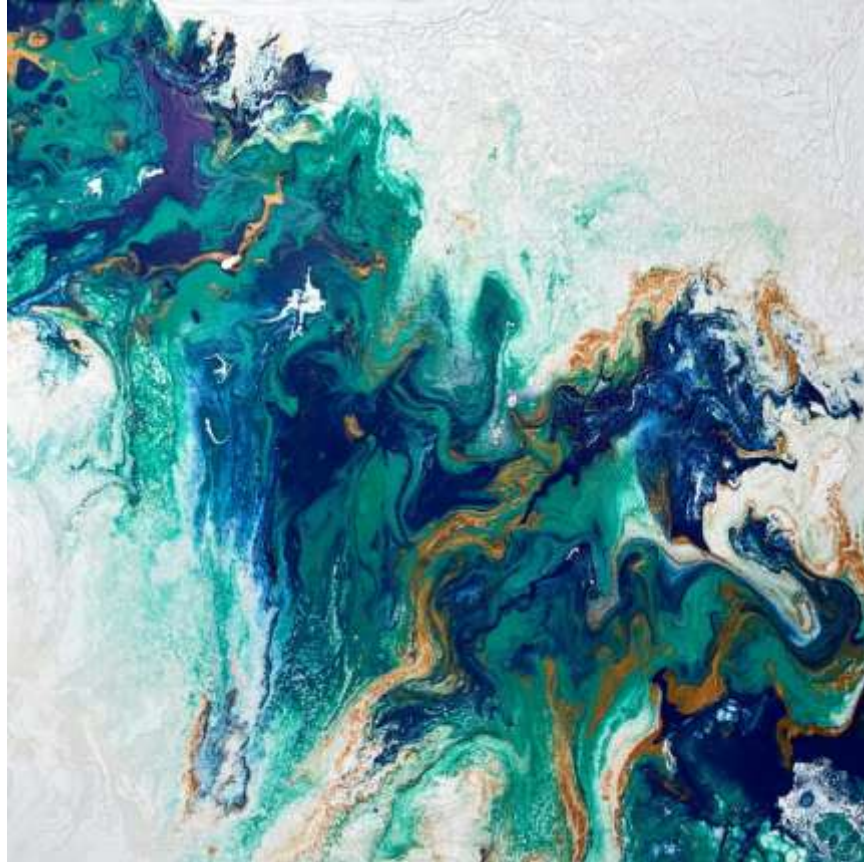
Rivers in the Desert, Lorrie Fowler

1111 North 11th Avenue East, Duluth, MN 55805