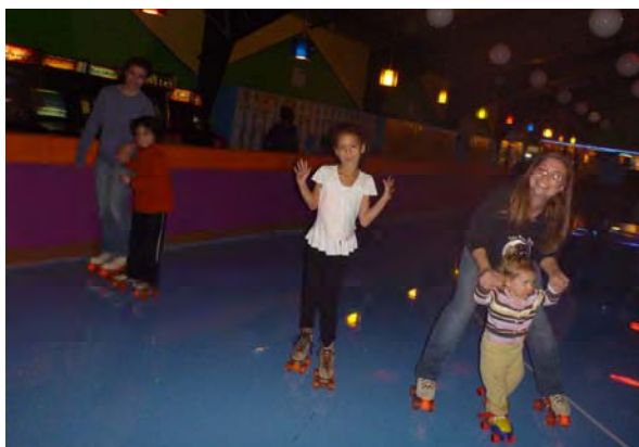
Intergenerational Event at World of Wheels

18 senior high youth prepare a meal for CHUM during their 11-11-11 overnight