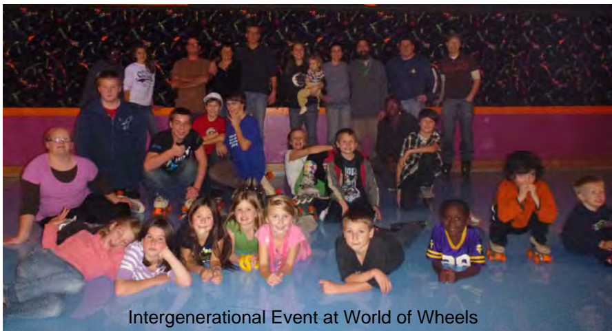
Intergenerational Event at World of Wheels

—and I'm thankful that this small boy we gather around in Advent grew up to give us guidance on how to express all this gratitude. I'm thankful that he used his dusty, thirty-something sandals not just to walk with and teach with and heal with (though Amen, yes, Amen!), but also to boot us back out the doors, to live into our gratitude, in every breath of life and drop of blood in these wild and precious lives we share .