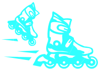
More pictures from World of Wheels