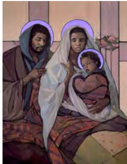
The Holy Family collection of Loyola School, New York, NY