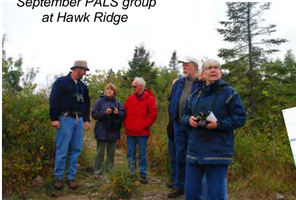
September PALS group at Hawk Ridge

Meet in the Peace Church kitchen on TUESDAY, NOVEMBER 15 ( not our usual Thursday night ). We will meet at 6:00 PM and fill bags of sugar and flour. Afterwards we will gather for a meal of pizza. Contact Linda Goese (525-3412) or goese@chartermi.net