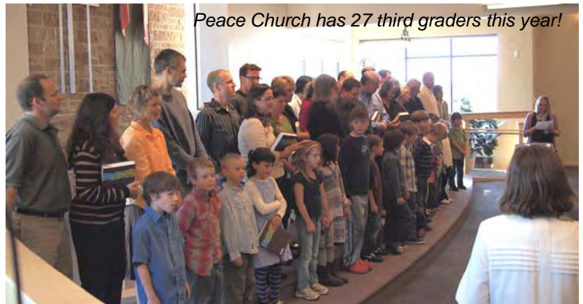
Many of them were in church with their parents to receive their new Bibles last month.

So that's where I find myself entering the season of holidays, and the energy I bring into our congregation. We begin with learning who are people are and what they stand for. We respond with thanksgiving, which takes us on the following Sunday into advent, which takes us to the new life, and hope, of Jesus. Perfect way to tell a story.