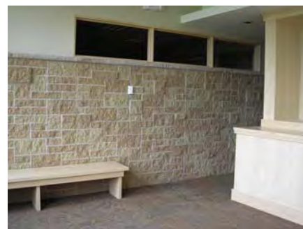
Pictured above are two views of the new chapel space.