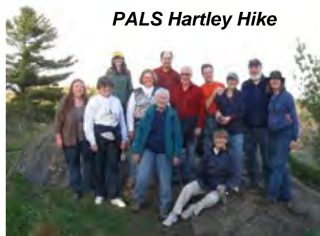
PALS Hartley Hike

"Peace Adults Learning and Socializing" 4th ANNUAL HUSKIES GAME AND TAILGATE PARTY! Thursday, June 30, 5:30 pm, at Wade Stadium.