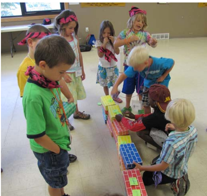
The treasure of our Peace Church kids—at this year's VBS!

Seeds, leaven, fields, pearls and nets. The kingdom of heaven is right here, right now, in the daily of our lives. Jesus knew it all along. If you want to describe that which is beyond all words, you begin with the words we all know . . . dirt, seeds, birds, bread, water, loons, fish, joy. The kingdom of heaven is like these things, the kingdom is found in these things. The word made flesh plows the fields of the daily with us. We are walking on treasure. Do you understand these things?