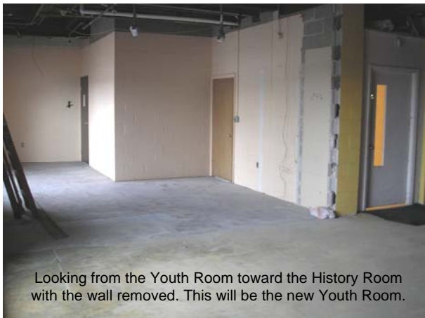
Looking from the Youth Room toward the History Room with the wall removed. This will be the new Youth Room.