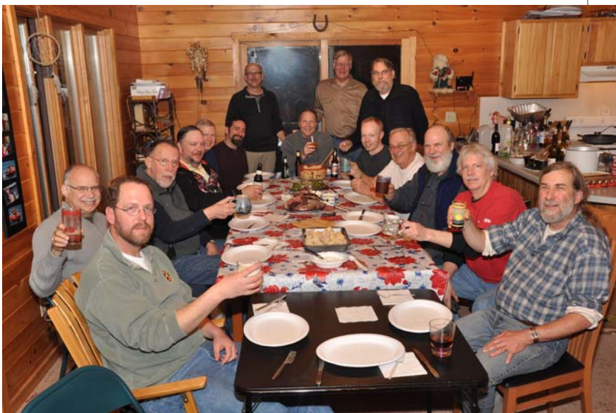
Peace Church Men at the recent Men's Retreat

Join us at Duluth Grill (27 th Ave. W.) every other Thursday at 7am for breakfast and conversation.