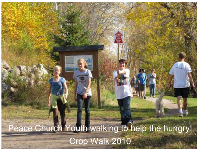
Peace Church Youth walking to help the hungry! Crop Walk 2010

August 27-September 4, 2011 – Intergenerational Work Camp to Back Bay Mission in Biloxi MS. (More info on page 8)