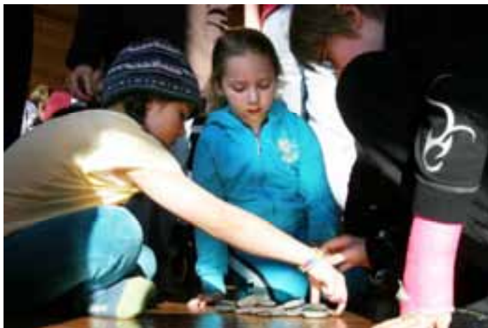
Kids creating a cairn during Winter Camp worship, to mark that God is in this place.