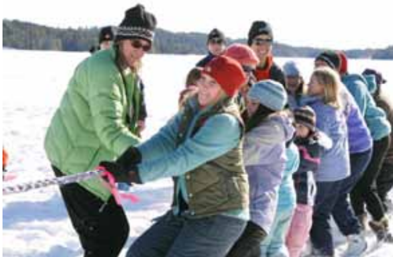
We're Pulling Together! Teamwork at Winter Camp