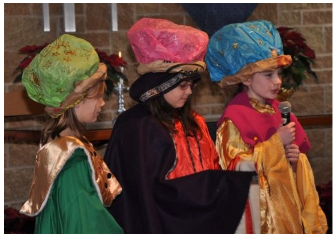
Peace Pageant Wise People