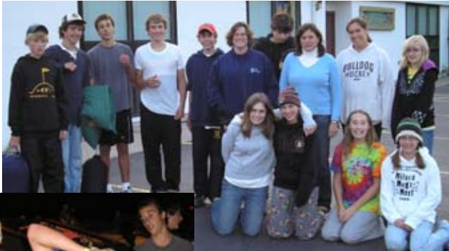
Night Without a Home