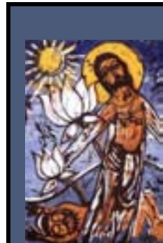
Resurrection by Solomon